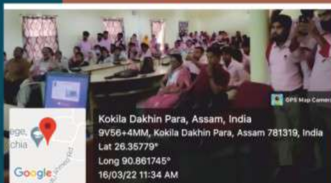
Attending PM's Programme