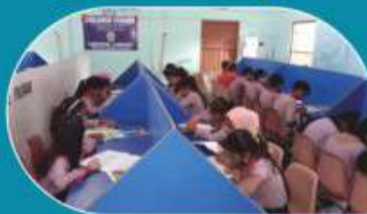
Students Reading Room in Library

The Central Library of Nabajyoti College was established with the inception of the College as its integral part. Since the beginning it has been maintaining growth and excellence and presently the Library is well equipped and enriched with 27,910 books. The Library is a registered member of the online database N-LIST under INFLIBNET Centre (Information and Library Network), Ahmedabad -IUC of UGC. Students are provided with a unique user name and password to access N-LIST, facilitated by the librarian. There are different sections inside the library viz. Reading Room Section, Stack Area Section, Periodical Section, Browsing Section and Reference Section etc. It provides a strong support in terms of library and information services to its user's fraternity within the campus. The library is open to the students, faculty and staff of the College. The library conducts user orientation programme for the new students every year to make them familiar with its resources.