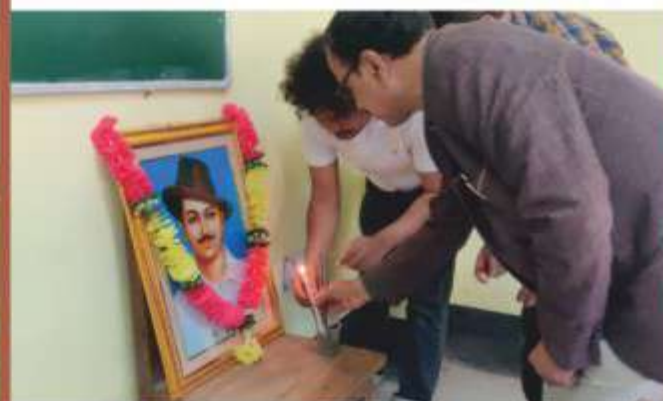
Homage to Swahid Bhagat Singh