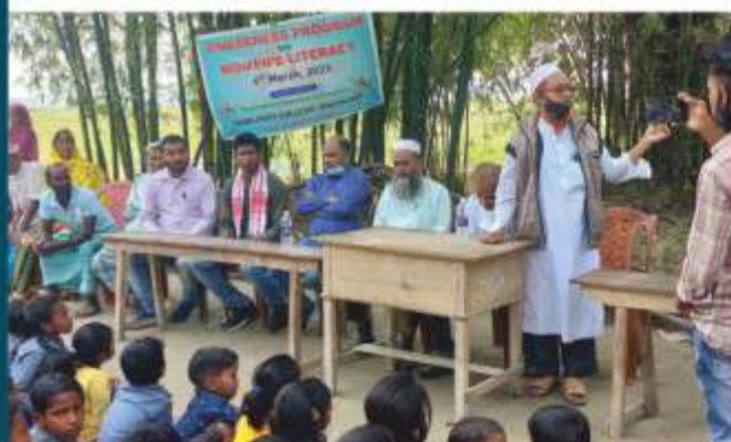
Awareness Program on Women Literacy