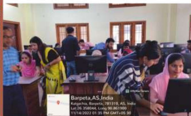
Certificate Course on Computer Application