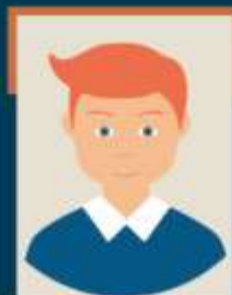
(Appointment on the process)