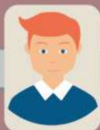
(Appointment on the process) LDA