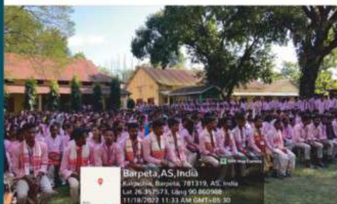
SU Election Open Debate