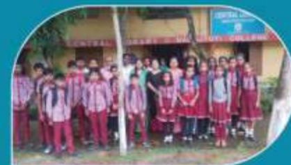
Participants of Children Corner in Central Library