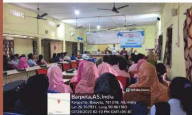
National Science Day