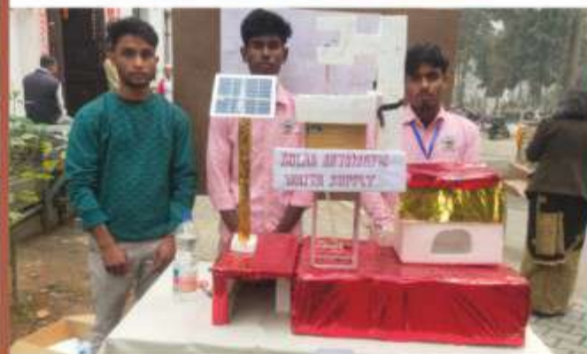
Scientific Model Presentation at GU