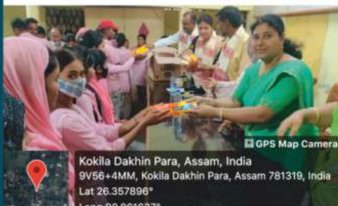
Health Awareness Program