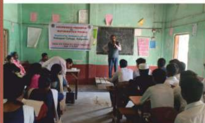
Programme on Mathsophobia