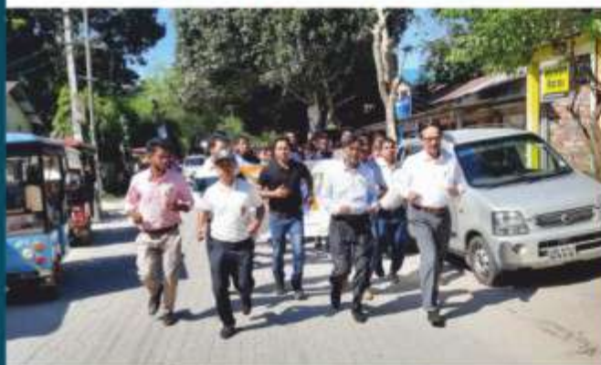
National Integration Day