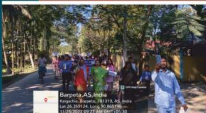
Communal Harmony Campaign