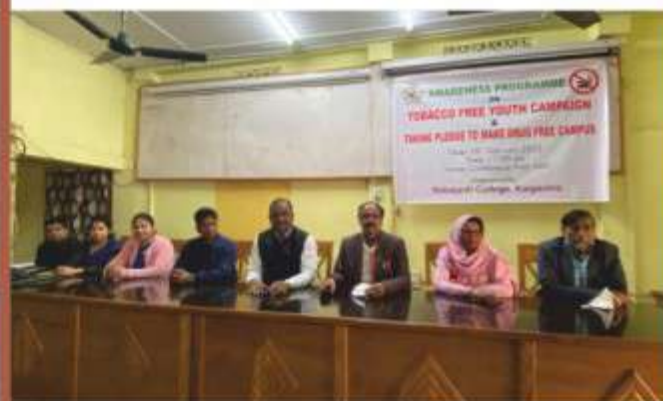
No Tobacco Campaign