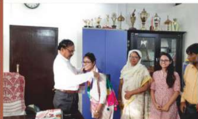
Felicitation to NET Qualifiers