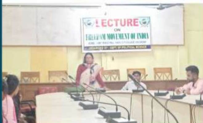
Lecture on Freedom Movement